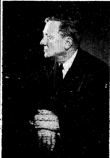
Justice William O. Douglas To Speak on "Erosion of Liberty"

Supreme Court Justice William O. Douglas and writer Adolph A. Berle will deliver lectures at the College in the near future.