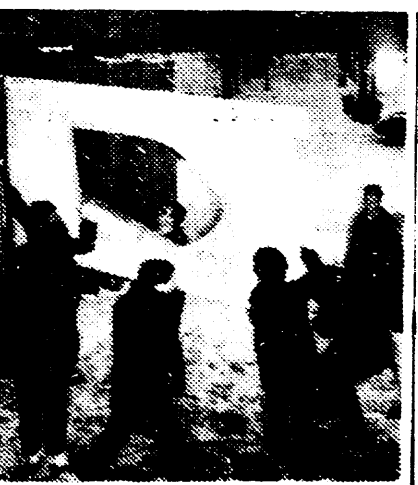
Setting The Stage Moving Day

Which will triumph — true love or a vegetable? This is the question asked in the Musical Comedy Society's production of "Once Upon A Mattress."