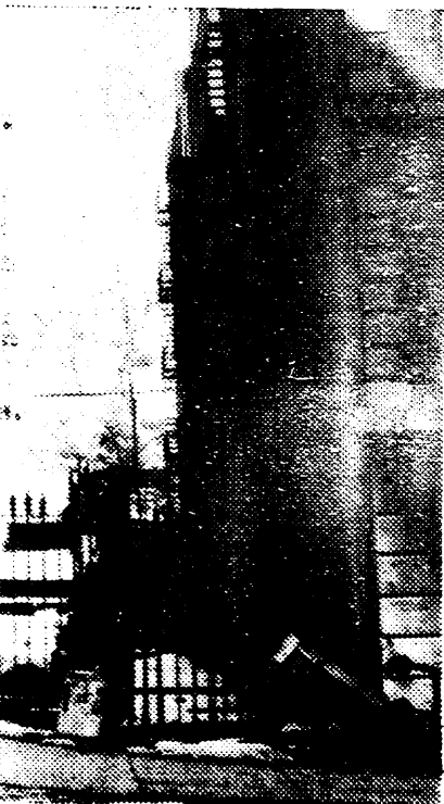
Street Scene "Our Test As Human Beings"